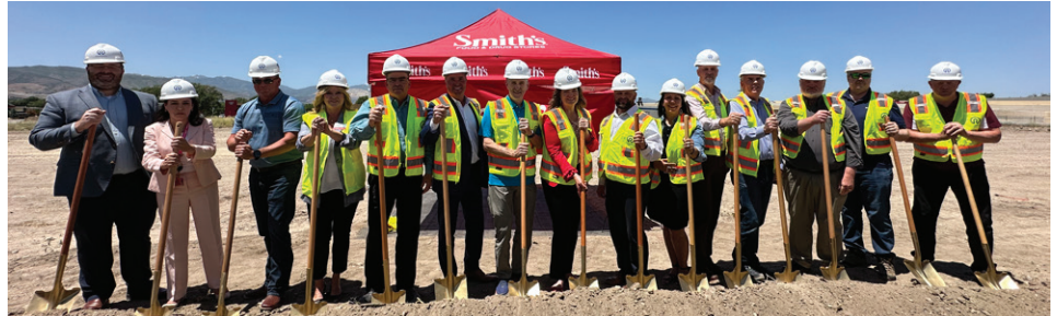
Groundbreaking ceremony for the new Smith's Grocery Store on June 13, 2024.

As you can see, this project took many people to make this happen. Thank you to past and