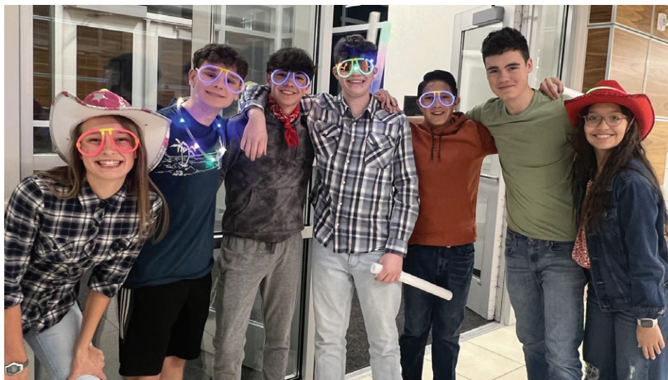
Youth council members at Hoedown Dance in February 2024.

For more information go to: www.bluffdale.gov/Youth-Council