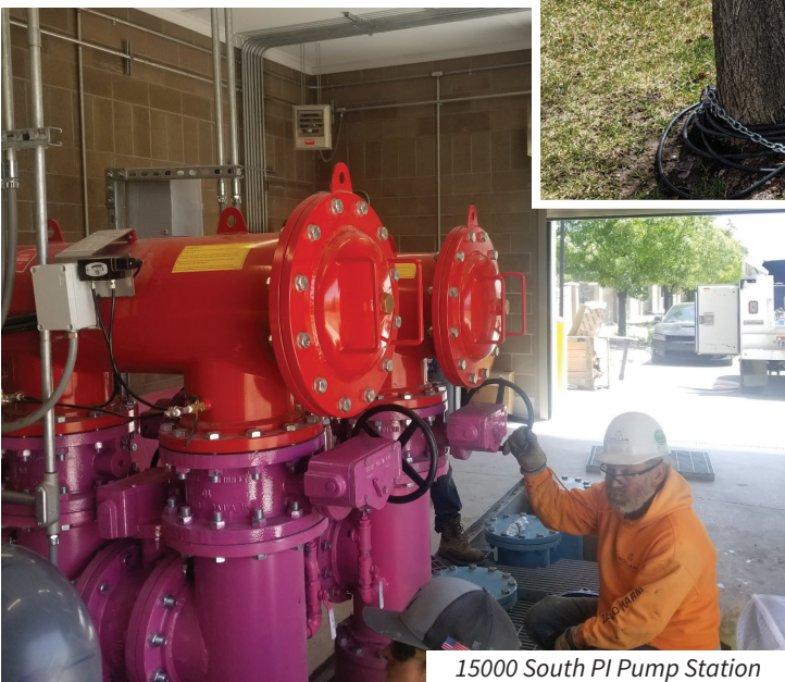
15000 South PI Pump Station