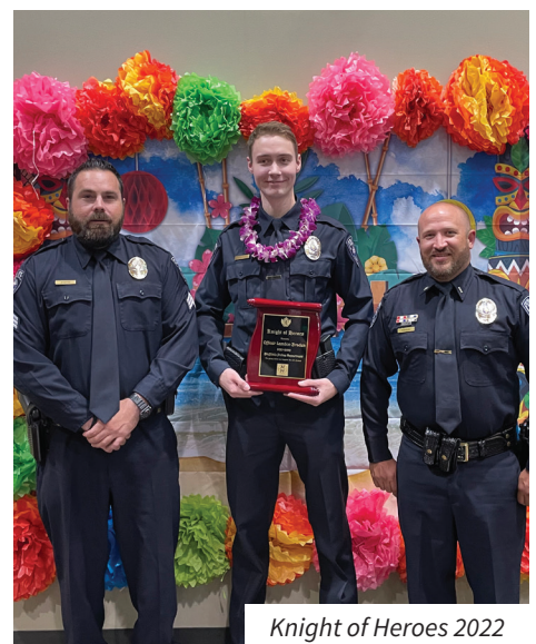
Knight of Heroes 2022