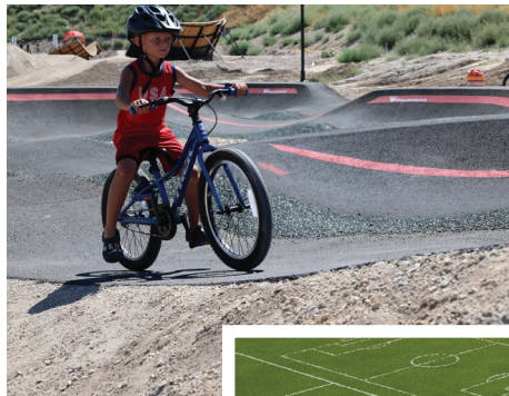
Above: Bike rider on the pump track at Day Ranch Park. Right: Site renderings provided to UORG for funds for the bike park.

100% City Property Taxes Allocated to New Fund