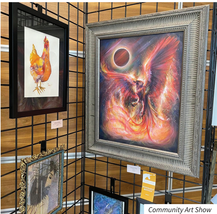
Community Art Show