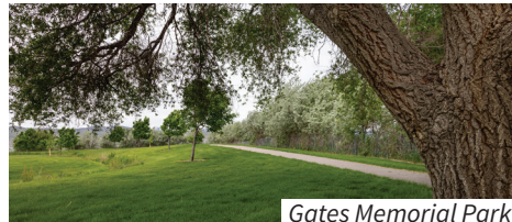
Gates Memorial Park