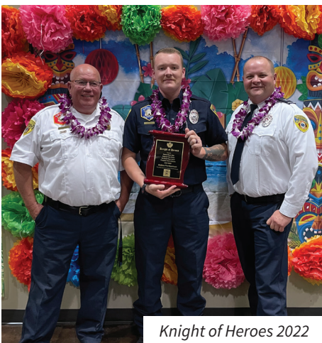
Knight of Heroes 2022