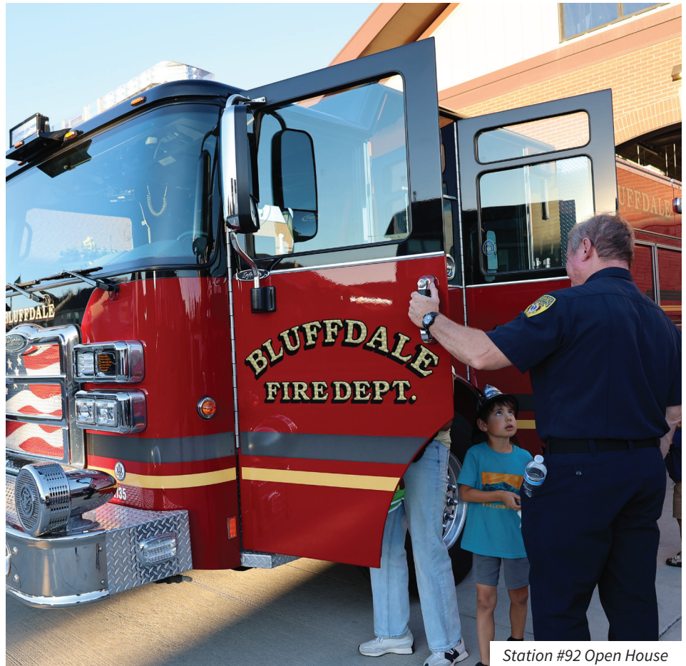
Station #92 Open House