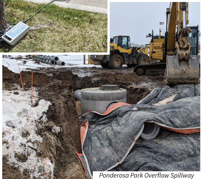
Ponderosa Park Overflow Spillway