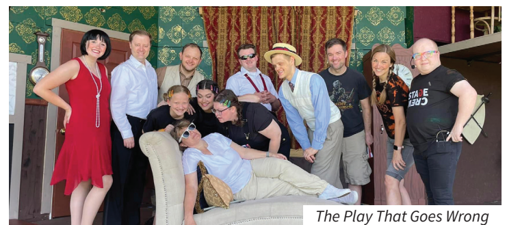
The Play That Goes Wrong