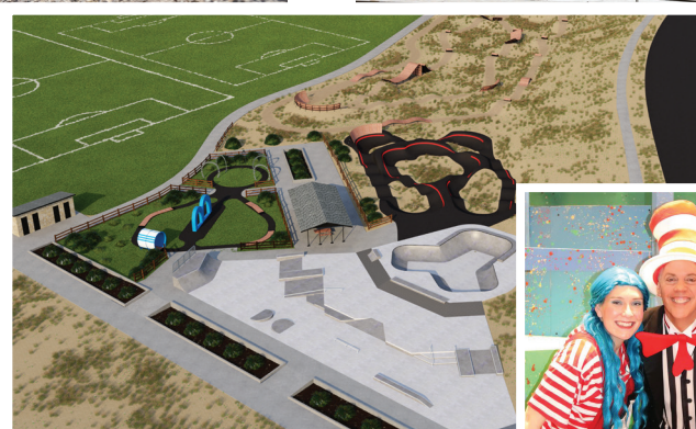
Right: Performers from the Bluffdale Arts production of Seussical . The ZAP Grant supports the plays and art shows presented by the Bluffdale Arts.