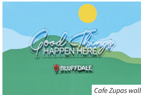
Cafe Zupas wall