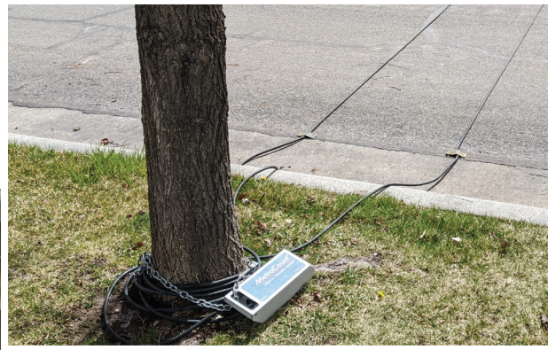
Left: Equipment used to conduct a traffic study.