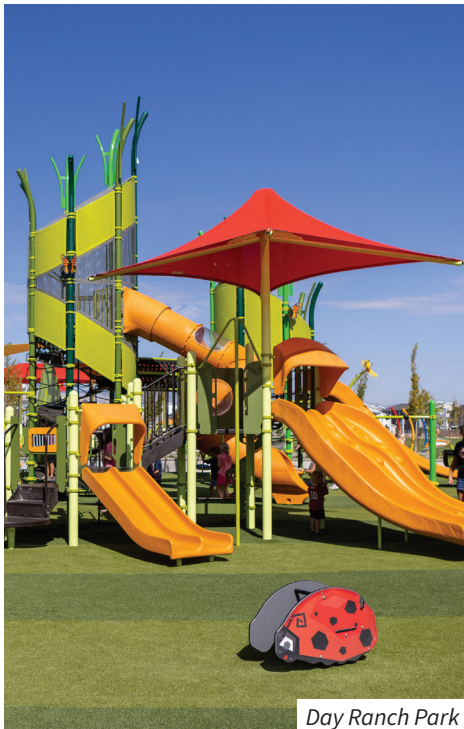
Day Ranch Park