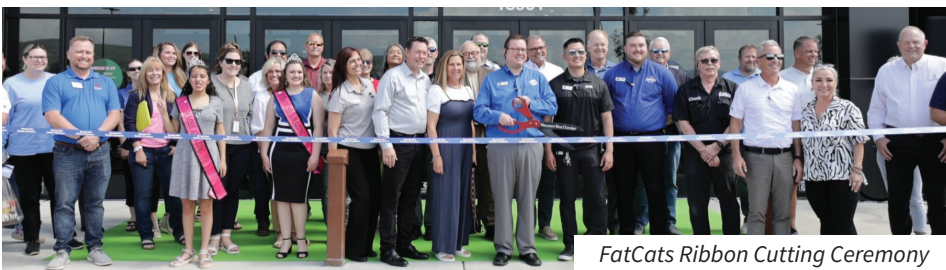
FatCats Ribbon Cutting Ceremony