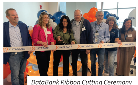
DataBank Ribbon Cutting Ceremony

692,237 sq ft of Commercial Retail Space