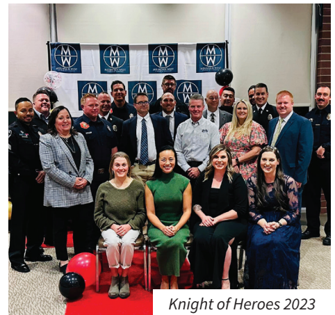
Knight of Heroes 2023