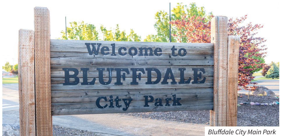
Bluffdale City Main Park