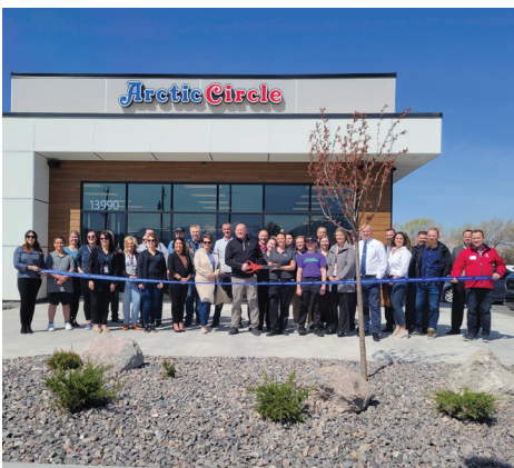
Arctic Circle Ribbon Cutting Ceremony