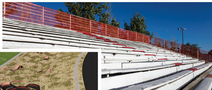
Left & Below: Images submitted to TRCC for grant for improvements to the Bluffdale Rodeo Arena.