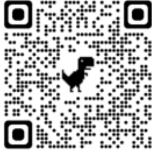
Read new utility policy

Beginning in January 2023, the collection process for past due Bluffdale utility accounts is changing. Accounts will need to be kept current monthly to avoid shutoff. We will no longer be hanging 24-hour notices on doors. Please read the complete policy at www.bluffdale.com/utilities