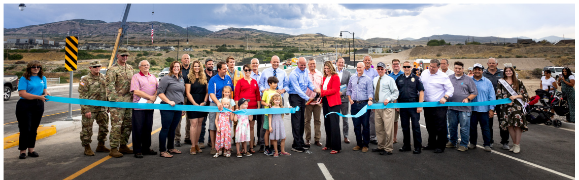
The Porter Rockwell Bridge ribbon cutting ceremony and celebration on August 25, 2022, officially opened the road for east/west travel between I-15 and Redwood road.