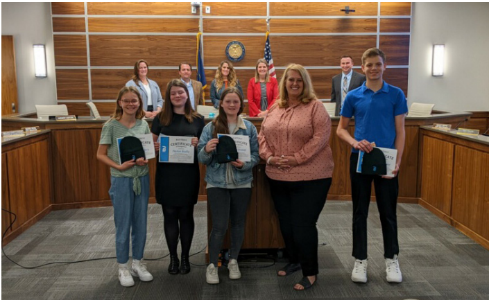
Exemplary Students from North Star Academy were recognized April 27, 2022 during the City Council Meeting.