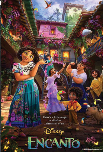
June 3rd Bluffdale City Park