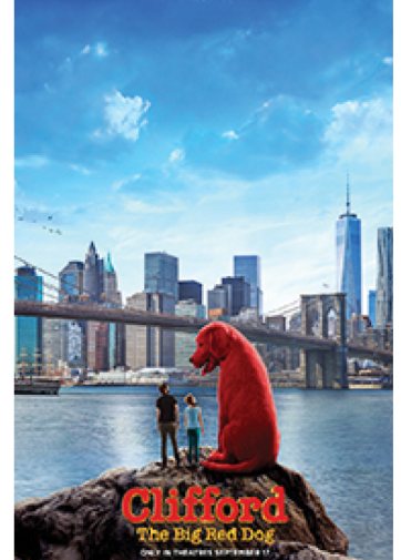
June 24th Mount Jordan Park