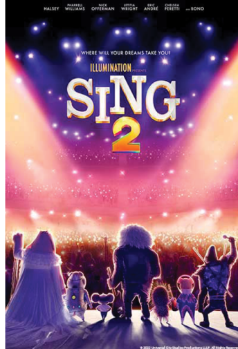
June 10th Mount Jordan Park