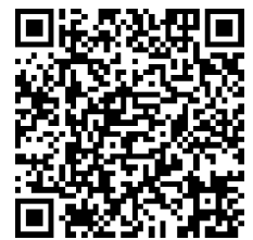
Water Seminar Survey

In March, we are going to focus on water safety. The water seminar is filled with information to help everyone understand water storage and safety. This seminar discusses recommendations on how much water to store, different options for storing, a variety of filters available and how to purify water.